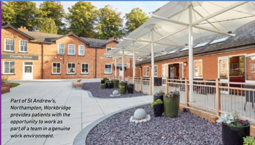
Part of St Andrew's, Northampton, Workbridge provides patients with the opportunity to work as part of a team in a genuine work environment.

Our award-winning vocational services are at the heart of each patient's recovery plan. With dozens of courses, work-environments and skills-based opportunities to choose from, patients can develop real-world experiences which help to build confidence and resilience. Services on campus are extensive, and we also partner closely with community services and educational institutions such as the University of Northampton.