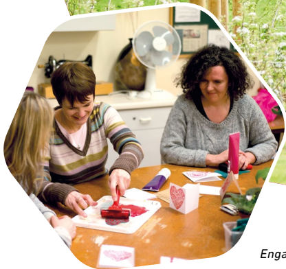
Engaging in an art workshop