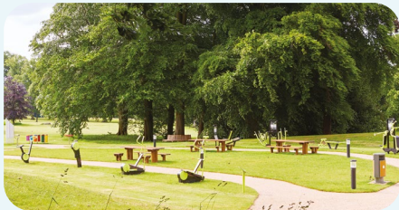
Northampton outdoor gym

“This is the first place people really care about me and want me to do things and to do well.”