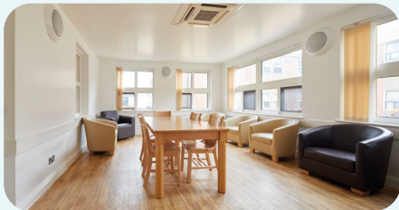
Conservatory meeting room