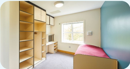
A bedroom on Heygate PICU