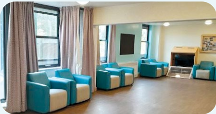
Naseby day area